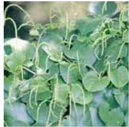
Madiera Vine

There is now funding available for weed & feral animal control on Crown Lands. For more info contact Frank McLeod on 02 6640 3416 email frank.mcleod@lands.nsw.gov.au . Applications close 25th June.