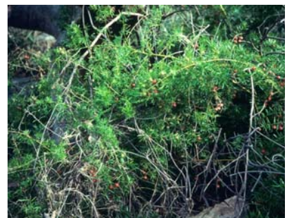
Asparagus Weed, DPI NSW