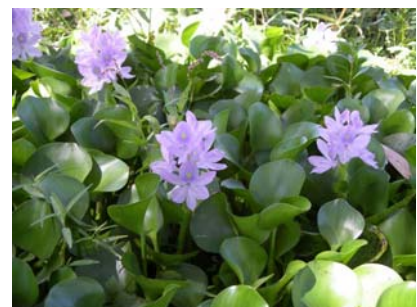
Water Hyacinth