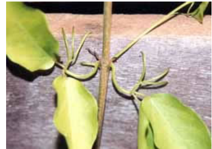
Cats Claw Creeper