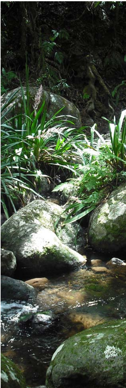
Brindle Creek, Photo Tara Patel