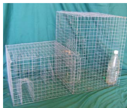
Indian Myna trap