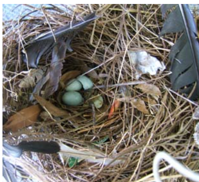
Indian Myna nest