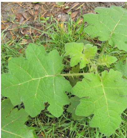
Tropical Soda Apple

Casino Woolworths Complex, weeds display and stall