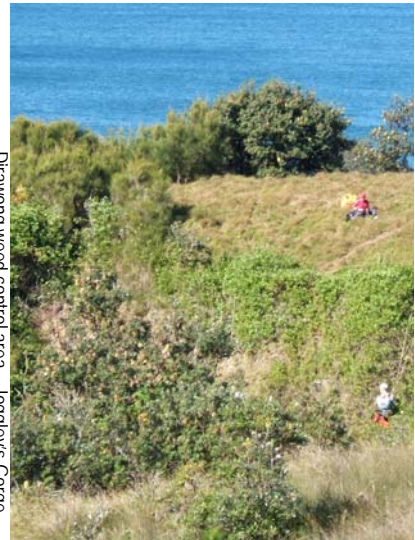
Dirawong weed control area—Joggley's Gorge

The Dirawong Reserve Trust is another step towards its vision in assisting the Dirawong Reserve to repair to its more natural state.