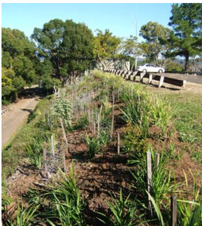
Greencorp planting at the lookout

Through the Northern Rivers CMA and the Land & Property Management Authority (LPMA) funds have been made available for creekbank restoration and Crown Lands in and around Kyogle.