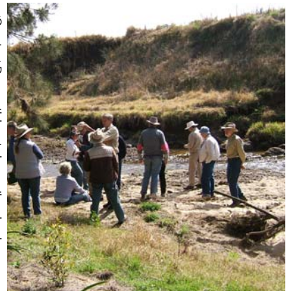
Overton Day participants inspecting riparian zone.