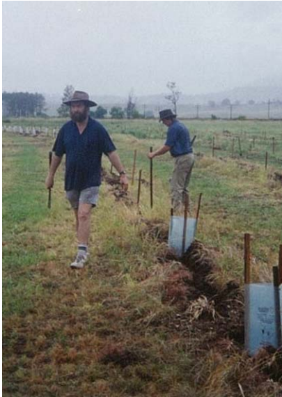
Group planting day in 1993

Cedar Point Landcare Group has called it a day after nearly 20 years as a registered Landcare Group.